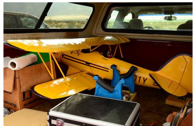
Dick Osborn's beautiful nitro powered Waco Biplane, flies well according to Dick, but he didn't fly it this day.