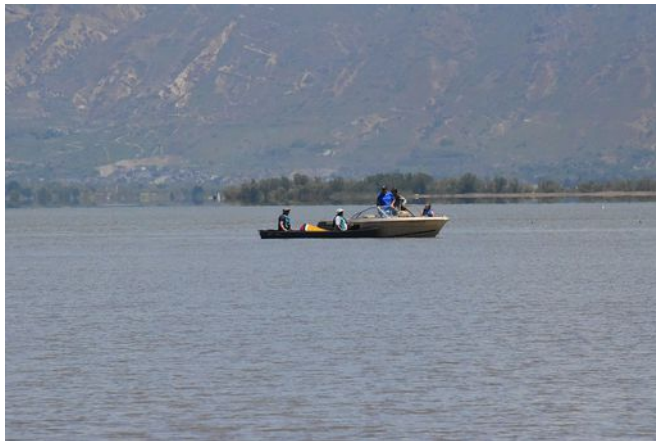
Meantime power boaters had picked up the plane and headed for the marina, but noticed Keith and James in the row boat and went back out to meet them to transfer the wreckage they had picked up.