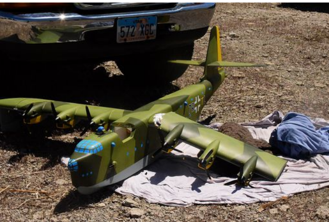
Dave's damaged but repairable BV 238 with a broken wing. Rest of the plane, motors, and props survived undamaged. It is one tough Warbird. The outer left wing panel has been removed for transport