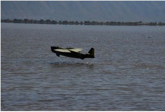
Dave Stack's model of Germany's giant 6-engine flying boat, a Blohm & Voss BV 238, heaviest aircraft ever built when it first flew in 1944 and capable of reaching the USA, in a take off run that ends in a crash in shallow water.