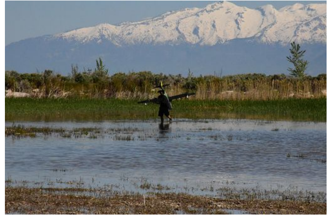
Dave Stack wading back to shore with the damaged BV 238. Note the size of this model, the biggest at the float fly. Dave said excessive elevator rate made the plane un-flyable for him.