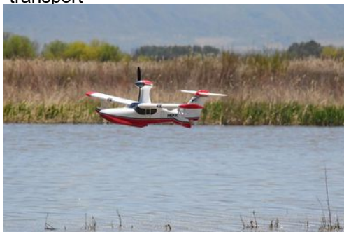
Steve Wilson's Tidewater making a landing (or should it be called a watering?) approach. No, it's not a dead stick landing, just too fast a shutter has stopped the prop.