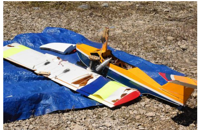
The Neptune is a shambles with wing tip floats being the only thing undamaged. Keith gets the prize for the worst crash of the day.