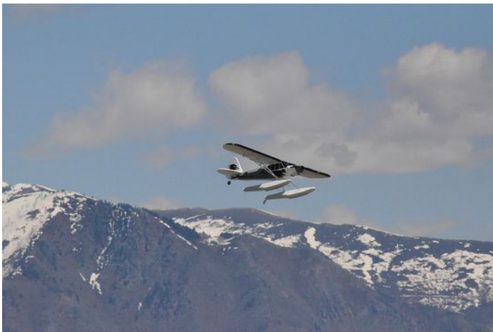
Steve Baker's FMS Super Cub in a realistic shot with mountain background