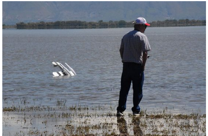
Bill's plane goes thru a wild take off run in a series of twists and turns, but ends up dunked upside down in the water. No harm done.