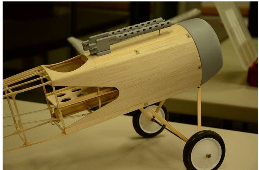
Fuselage of Rick Marshall's model of the Fokker D-VIII of WW I.